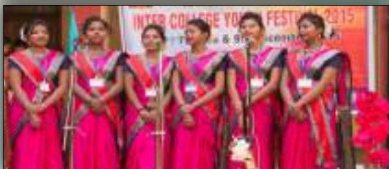
NIRMALA COLLEGE: THE OVERALL CHAMPION