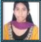
D. USHA GEOGRAPHY